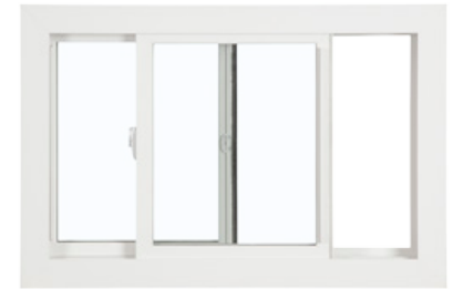
2-lite sliding window