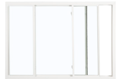
3-lite sliding window