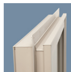
Thanks to the integrated J-Channel design, you can easily install vinyl siding around windows — without extra labor or materials.