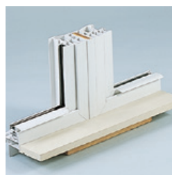
Choose the optional wood jamb extension and factory mull for simpler installation, without extra labor or materials.