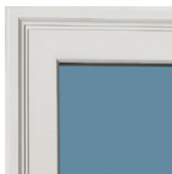
True brick mould exterior.