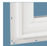
Popular brick mould exterior profile for maximum curb appeal.