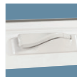
State-of-the-art hardware adds aesthetic appeal and smooth, easy operation.