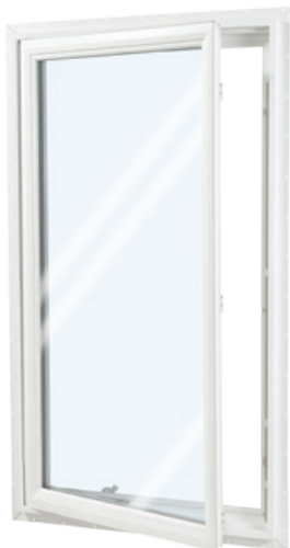
Single Vent Casement