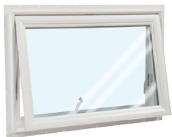
Single Vent Awning