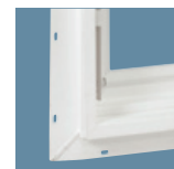
Integrated nail fin is pre-punched to target proper nail location for quick, easy installation.

Painted colors only available with 5/8" contoured and SDL grid. Only use mild, water based household cleaner on painted product and rinse immediately with water. See full cleaning instructions for details. Blinds, operators and glass panels available in white only.