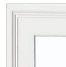
Brick Mould Exterior