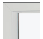
3- 1 / 4 " flat casing with sill nose