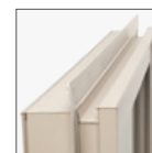
Pre-punched nailing fins and integrated J-channel