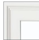
Brick Mould Exterior