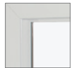
3- 1 / 4 " flat casing with sill nose