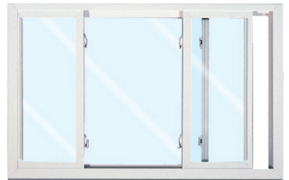
3-Lite Sliding Window