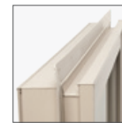
Pre-punched nailing fins and integrated J-channel