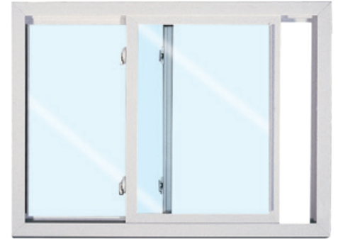
2-Lite Sliding Window